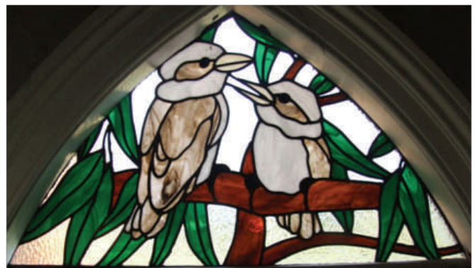
Darryl Trezise's Leadlight Window