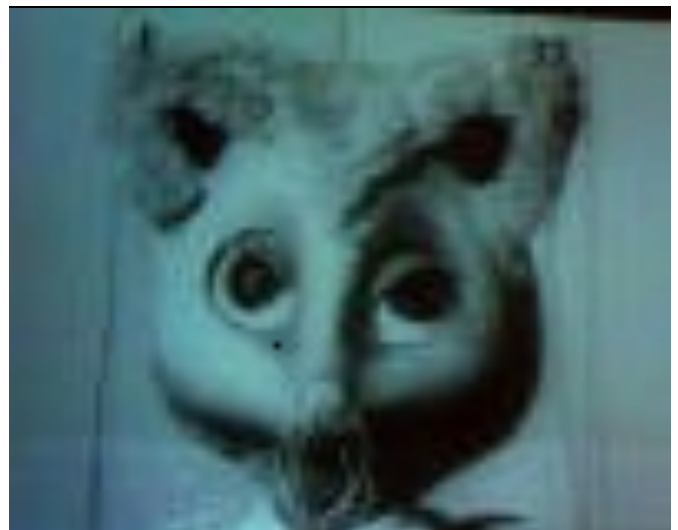
Sebastian the Fox—Sebastian's Greatest Adventurers

Those new members who joined for a half year will be up for renewal at the AGM in July along with all other members. However new members paying for a full year in June will be carried forward to