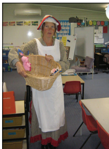
Mrs Wishy Washy

The Portland Rotary and the Glenelg Shire Council Art Shows are on next month have you been busy painting, and put in an entry? if not give it a go, you could win the prize! The Mural has almost been