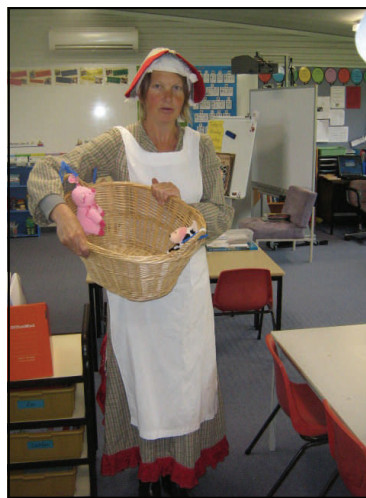
Mrs Wishy Washy

The Portland Rotary and the Glenelg Shire Council Art Shows are on next month have you been busy painting, and put in an entry? if not give it a go, you could win the prize! The Mural has almost been