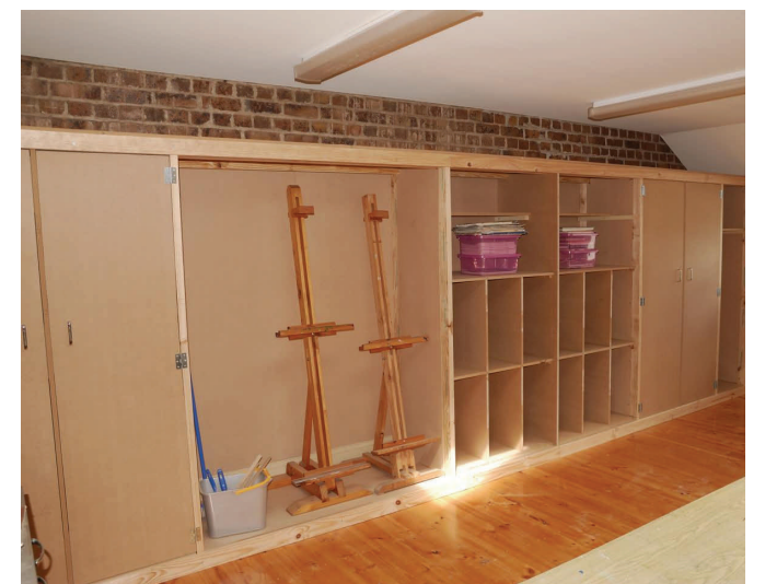
The cupboards are a new addition to the Mezzanine room at the Arts Company

As a result of networking at the conference some interesting artists have booked to travel to Portland to stay at the June Hedditch Studio Apartments and share their skills by