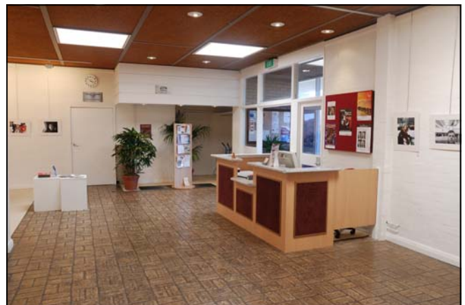
The Redecorated Interior of the PAC