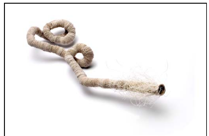
Ilka White - "Casting" From the "Walk" exhibition at the PAC