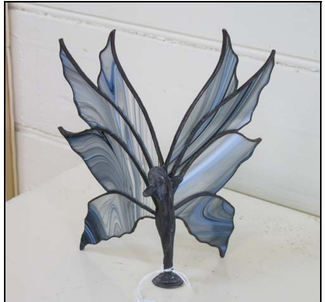
Leadlighters Guild - Black & White Fairy on sale at the Arts Company