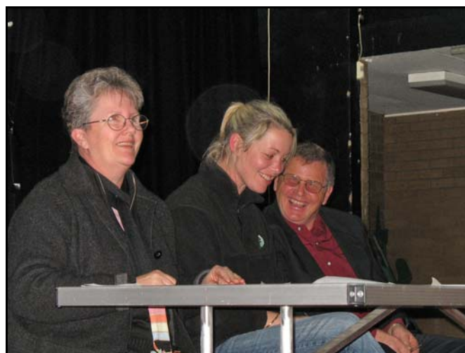
The returned President, Secretary & Treasurer at the AGM