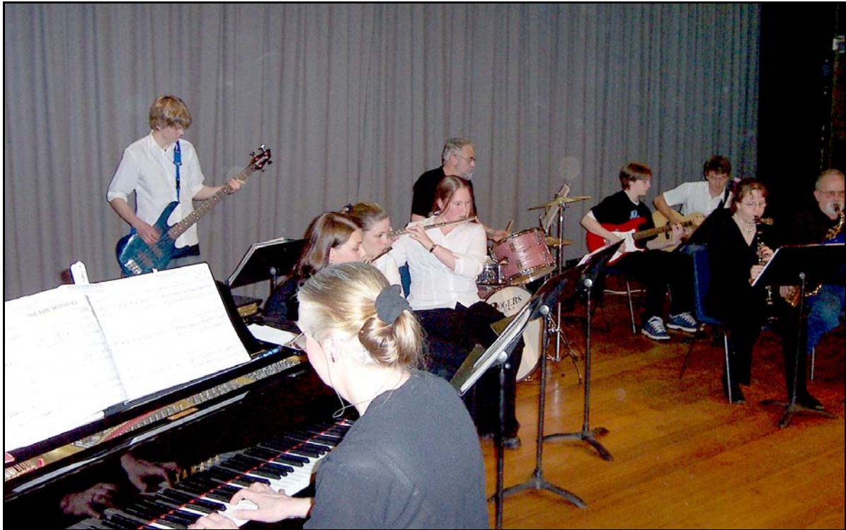
The Concert Band at the CEMA Arts Centre 30th Celebrations