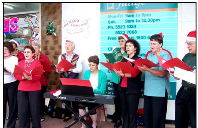
The Choral Group singing "Carols in the Street"