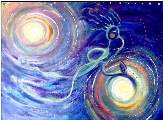
“Between Worlds” from the Gallery at the Arts Company